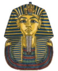
Tutankhamun's death mask

The discovery helped people to understand more about the Egyptians pharaohs .