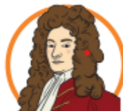
Sir Christopher Wren