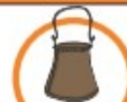
leather water bucket