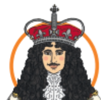
King Charles II